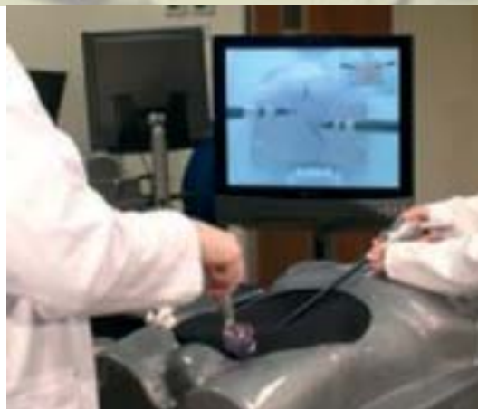
Orientation and basic suturing tasks

Virtual Reality Training: cutting edge technology for training young surgeons in Tallaght.