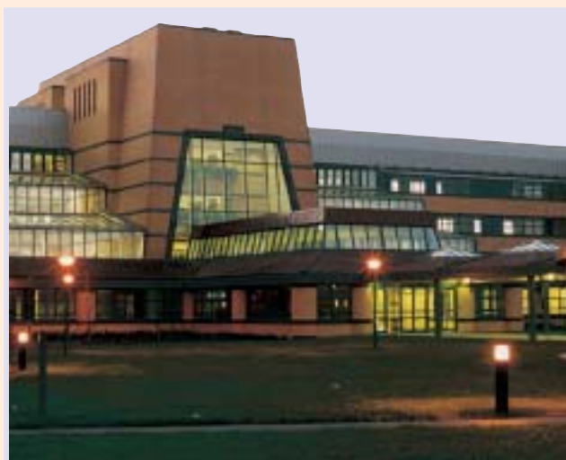
The Hospital at Tallaght

Our core values of Voluntarism/Self Help, Inclusiveness, Innovation/Originality, Effectiveness and Objectivity inform and guide our work to develop a credible and sustained programme of broadly defined research activity at the hospital.