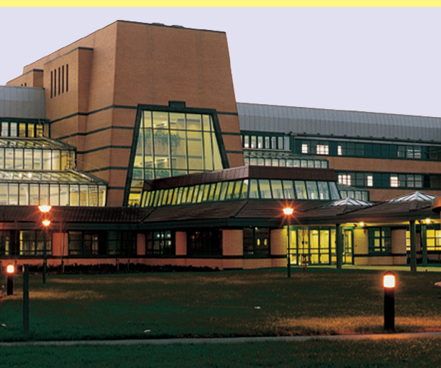
The Hospital at Tallaght

Our core values of Voluntarism/Self Help, Inclusiveness, Innovation/Originality, Effectiveness and Objectivity inform and guide our work to develop a credible and sustained programme of broadly defined research activity at the hospital.